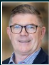
Andrew McRae Higgins